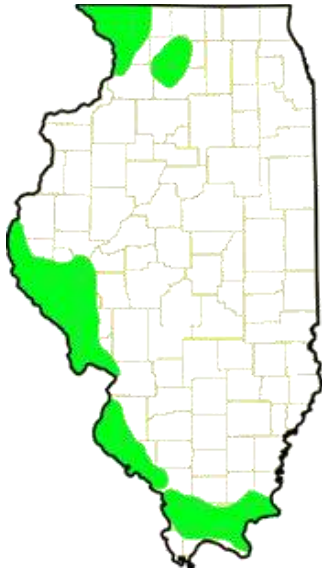
Regions in Illinois with karst