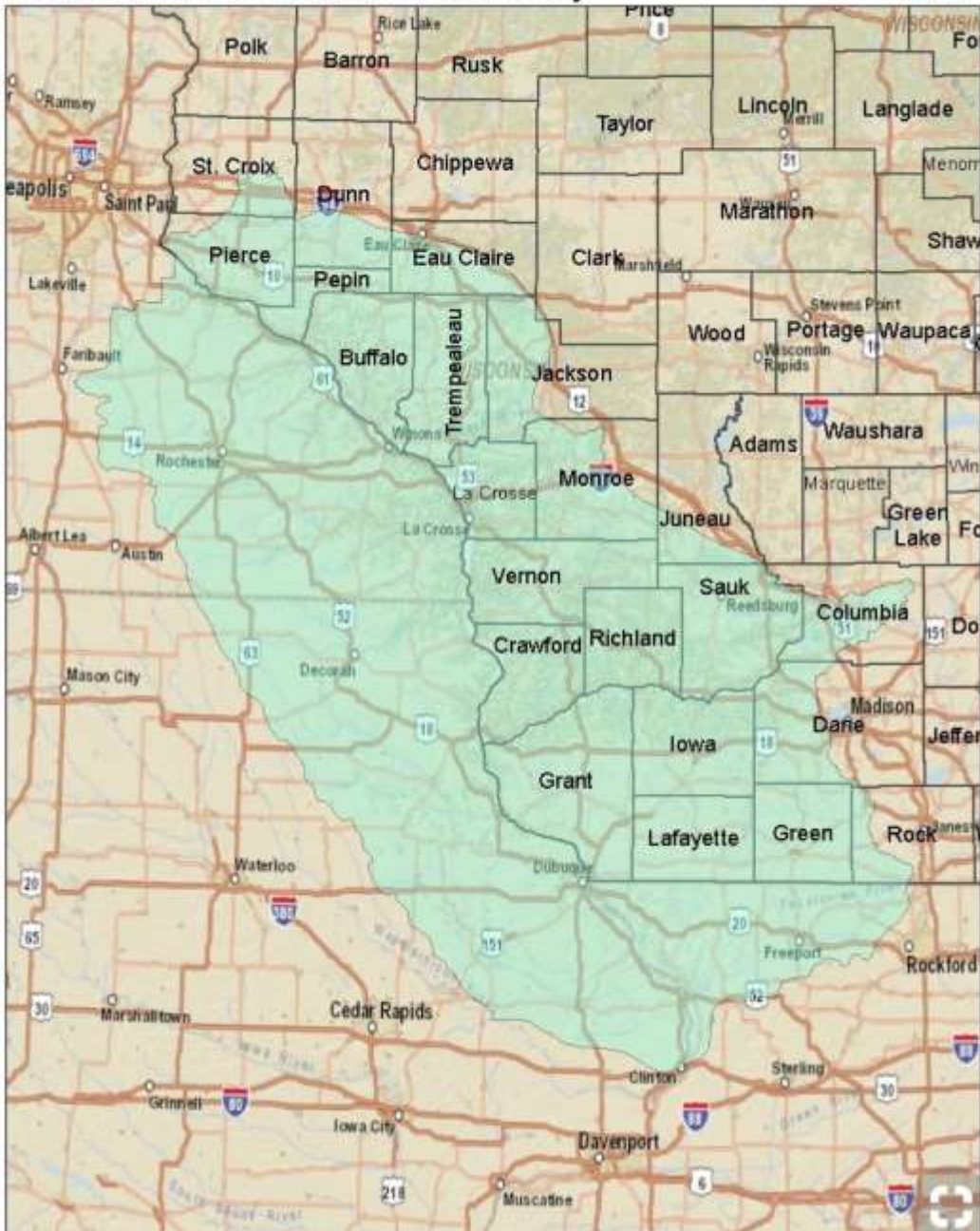
Map of entire Driftless Region