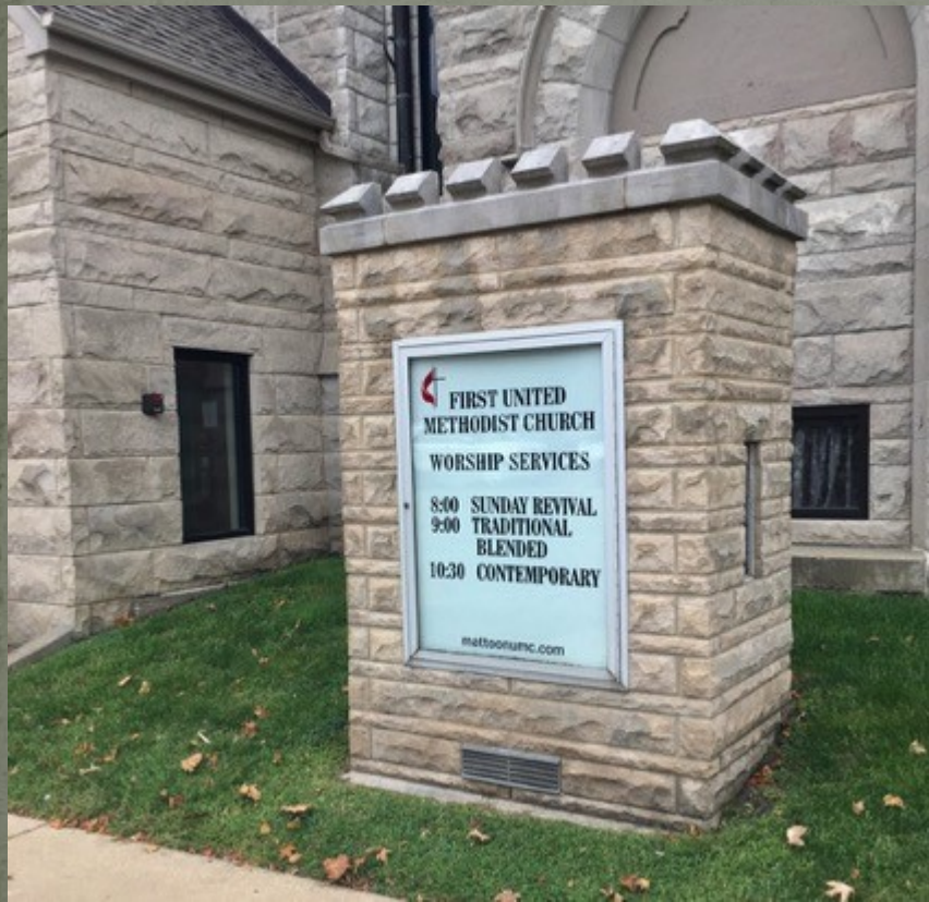
The new sanctuary