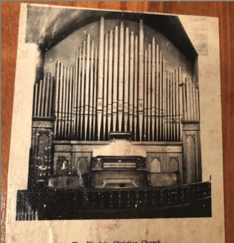
First Christian Church