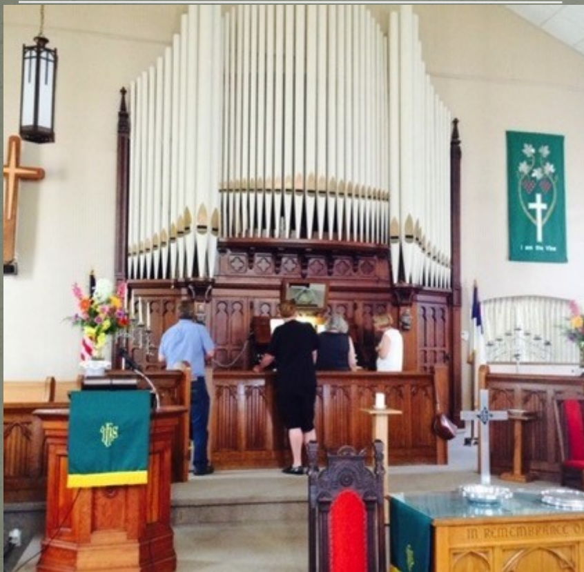
View from the pew