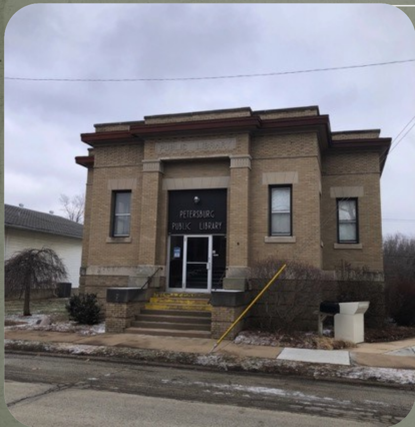
Carnegie Library, 1908